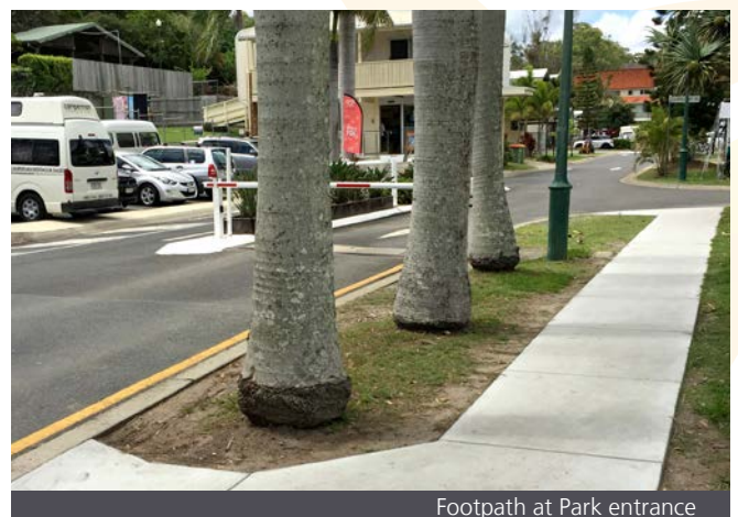
Footpath at Park entrance

Some camping sites have 100mm curved guttering but we also have sites with no guttering. Guests to please check with reception when making a booking.